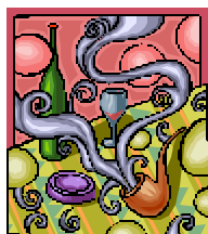
MBA Social May 16, 2003