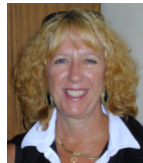
Your easiest option is to contact Program Administrator Candy Furo for all registration assistance!

There are registration details (courtesy Candy) inside this