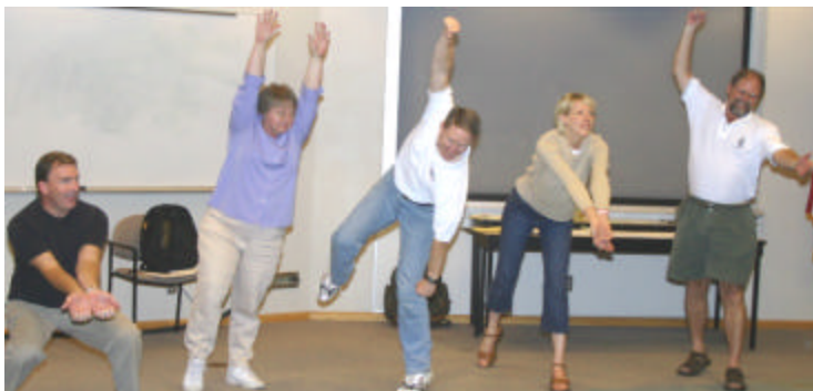
Students don't expect to do this in all their MBA classes