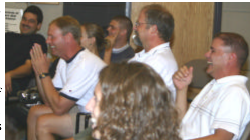
Students admire the creativity of fellow students

It was a fun, invigorating, and inspiring sixteen hours of class time, with students breaking out of their shells and engaging in various "games" and team exercises where