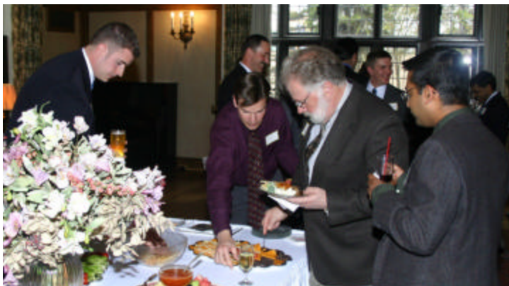
The food and the company are always great at the MBA receptions!