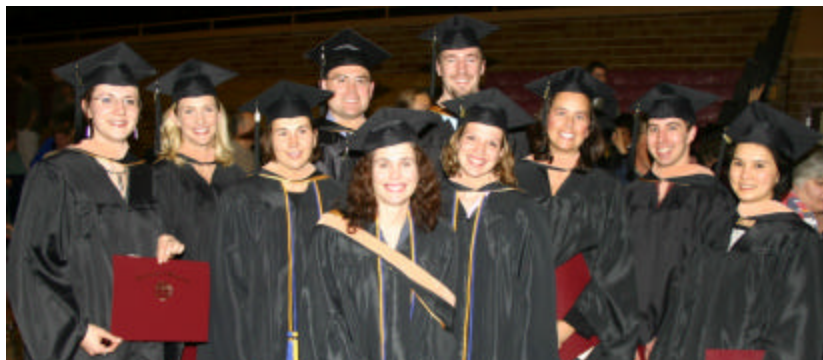
Some of our 2004 Graduates at the Graduate Commencement Ceremonies in Duluth