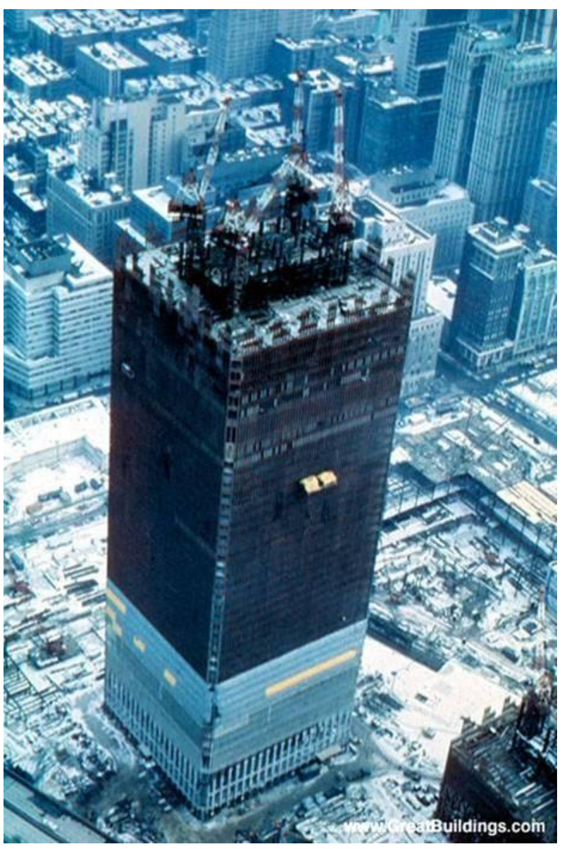
The WTC towers were solidly constructed with 47 steel core columns and 240 perimeter steel beams. 287 steel-columns total. Many doubt that random fires/damage could cause them to collapse straight down (official theory), and suspect explosives.