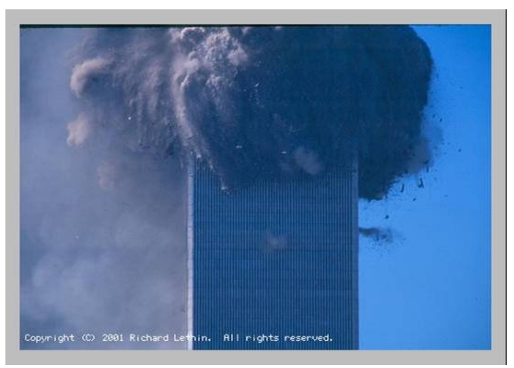
North Tower during top-down collapse. Notice mysterious squibs far below pulverization region.

Unlike WTC7, the twin towers appear to have been exploded "top-down" rather than proceeding from the bottom – which is unusual for controlled demolition but clearly possible, depending on the order in which explosives are detonated. That is, explosives may have been placed on higher floors of the towers and exploded via radio signals so as to have early explosions near the region where the plane entered the tower. Certainly this hypothesis ought to be seriously considered in an independent investigation using all available data.