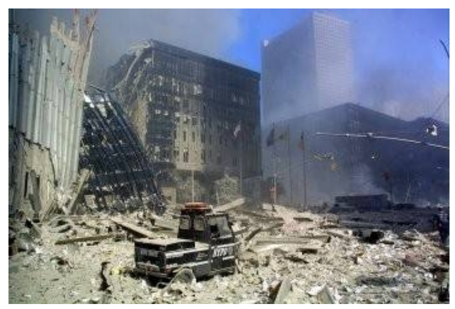
WTC 7 on afternoon of 9-11-01. WTC 7 is the tall sky-scraper in the back-ground, right. Seen from WTC 1 area.