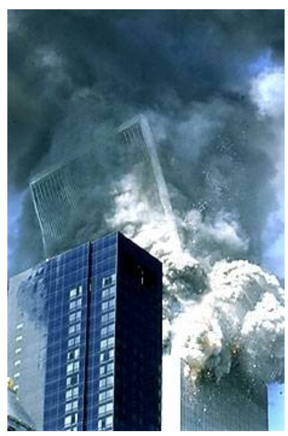
Top ~ 34 floors of South Tower topple over. What happens to the block and its angular momentum?

http://www.911research.com/wtc/evidence/videos/docs/south_tower_collapse.mpeg