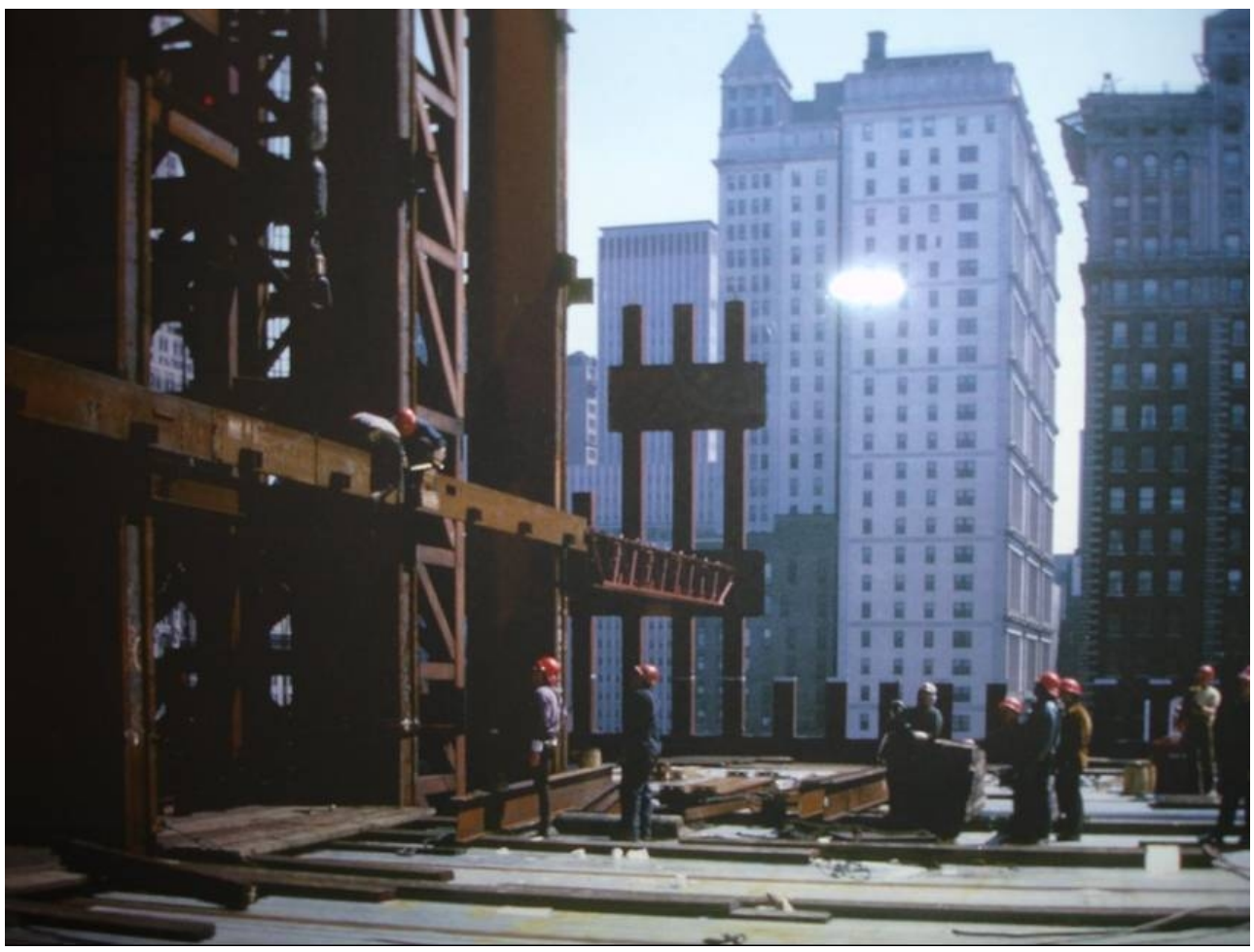
Steel-frame: Huge core (left) is an enormous heat sink. Notice workers standing on floor pan which is

firmly attached to the interconnected core columns.