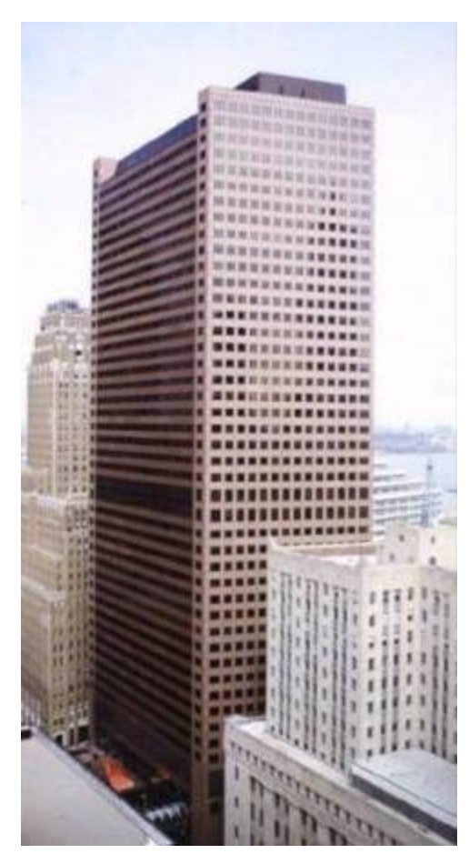
WTC 7: 47 - Story, steel-frame building..