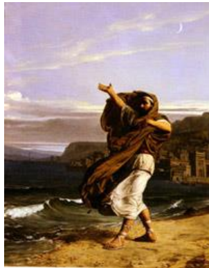
Demosthenes Practising Oratory (1870)

This Project is something with which you should be able to have fun .