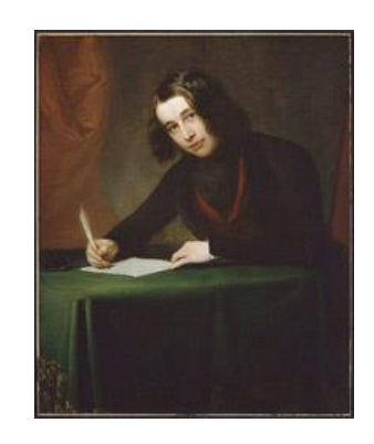
Charles Dickens (1842)