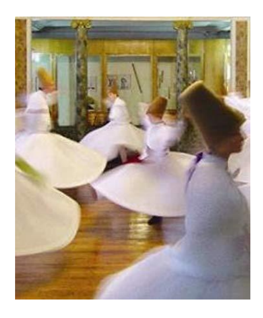
(Turkey; Mevlevis, are also known as Whirling Dervishes)