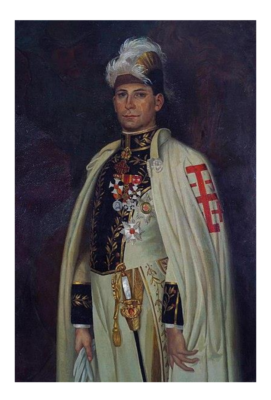
Wikimedia Knight of the Order of the Holy Sepulcher of the Holy See, ca., 1900 Immagine scannerizzata da "Ordini cavallereschi e cavalieri", di Arnone, C, 1954