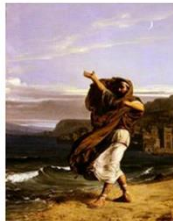
Demosthenes Practising Oratory (1870)