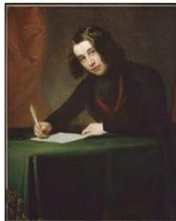
Charles Dickens (1842)