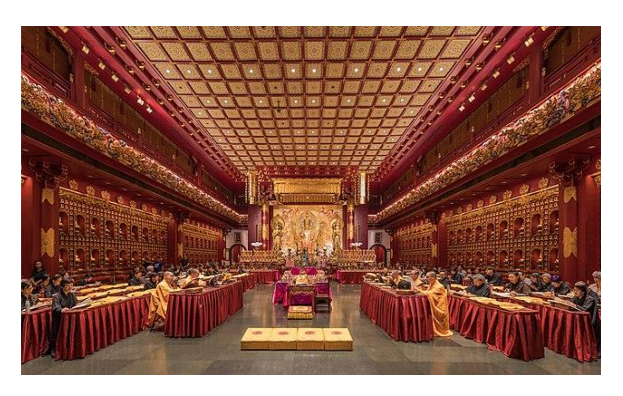
Buddhist monks and nuns praying in the Buddha Tooth Relic Temple of Singapore