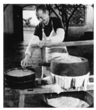
Food for Body and Spirit