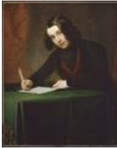
Charles Dickens (1842) Francis Alexander (1800-1880)