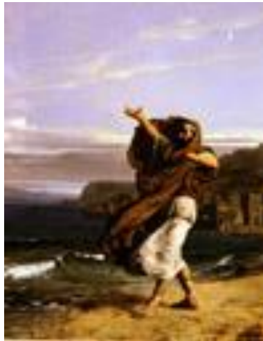
Demosthenes Practising Oratory (1870) Jean-Jules-Antoine Lecomte du Nouÿ (1842–1923)

REM: Your Term Paper is due next week . . .