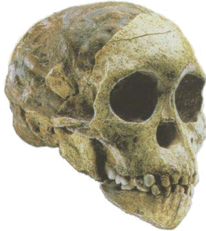
"The Taung Child" Australopithecus africanus