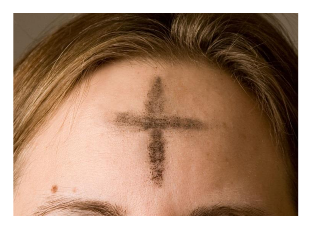
A cross marked in ash on a worshipper's forehead -- Ash Wednesday -- Wikipedia