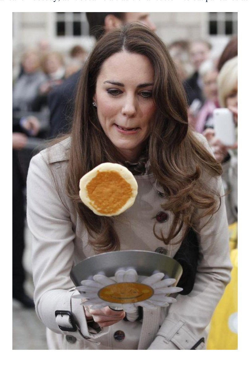
The Duchess of Cambridge Catherine "Kate" Middleton Flipping Pancakes

"In the United Kingdom, Ireland and parts of the Commonwealth, Shrove Tuesday is also known as Pancake Day or Pancake Tuesday, as it became a traditional custom to eat pancakes as a meal." -- Wikipedia