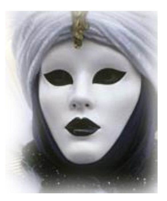
Lady in White Carnival of Venice