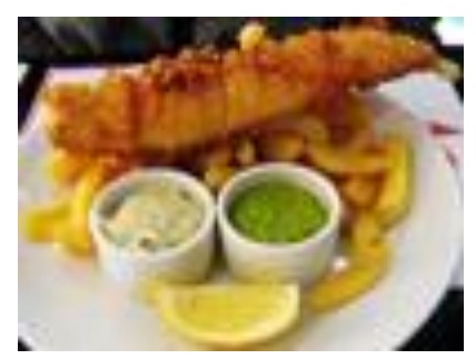
The Holy See" (The Vatican)