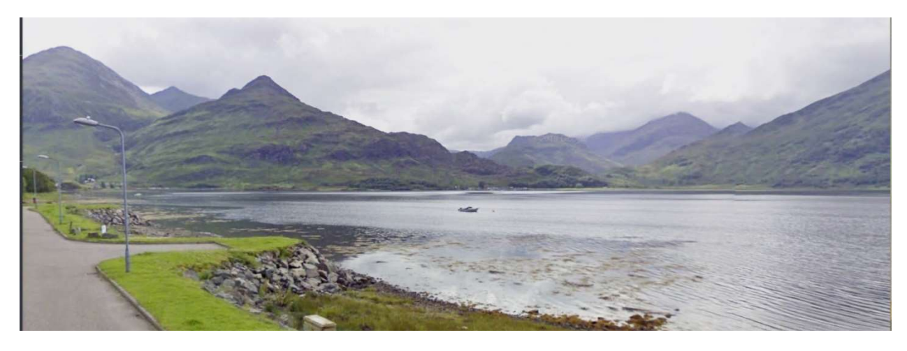
The 'Five Sisters' are the Five Sisters of Kintail (note not Four Sisters) that lie at the west end of Glen Shiel on the road to the Isle of Skye. The view is 'well known' and is popular with photographers and

As such it is always hard to fit a painting exactly to a modern day scene unless there are elements which clearly link the scene, or there are mountains which are so distinctive – i.e. the Matterhorn - that the picture really can't be anything else. That can be awkward in the Highlands. Our distinctive mountains are just that, but there are a lot of impressive other peaks that could be 'anywhere in the Highlands'. However the suggestion that it depicts the 'Four Sisters' is a good one and the terrain and peaks do seem to fit. ( Note from Mike Schroeder -- Here is a view from Google Earth, which strongly makes the case. Munger was a little further away, but the Google Earth views from there are occluded by trees. )