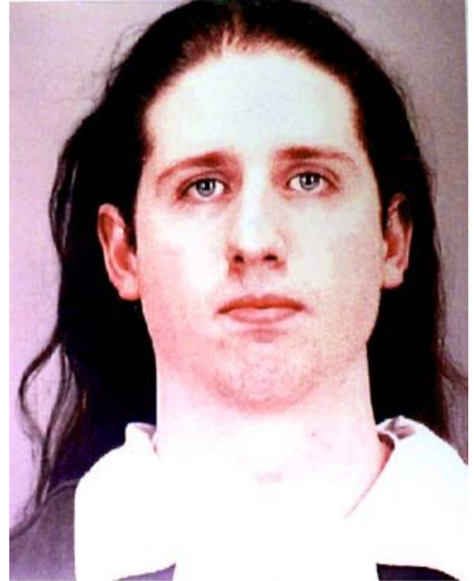
Santa Clara County Sheriff